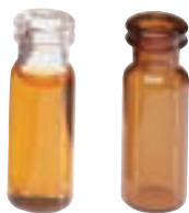
C4011-5, S5 C4011-6