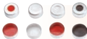
C4011-2A, C4011-3A, C4011-4A, C4011-5A