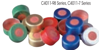
C4011-98 Series, C4011-7 Series